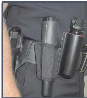
Ballistic weave holster (included) mounts easily on belt or in patrol car